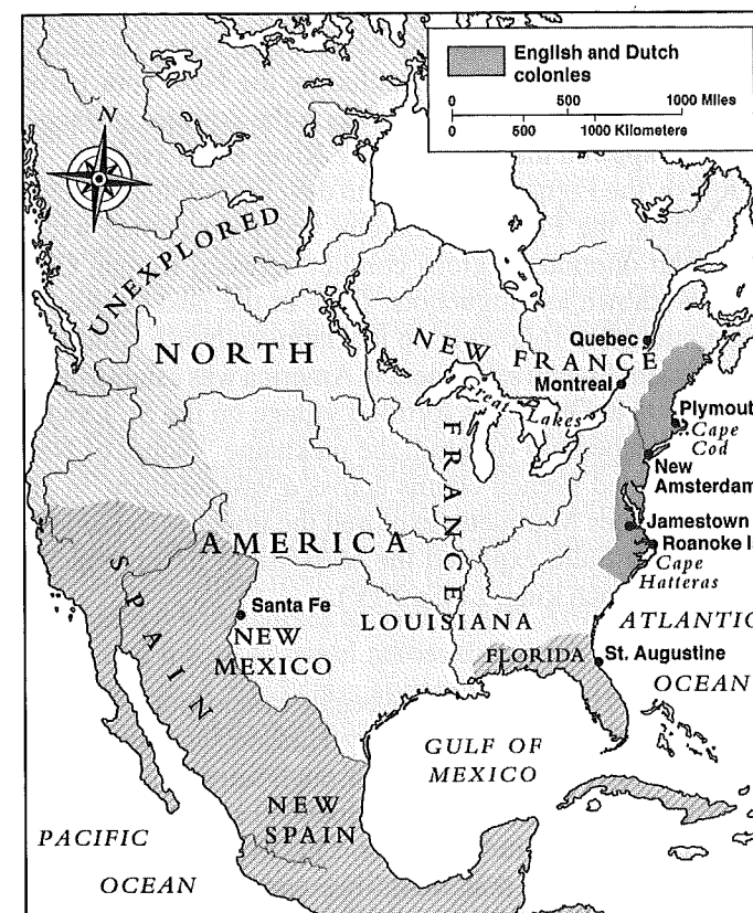
EARLY SETTLEMENTS IN NORTH AMERICA 1600s

The conquistadores sent ships loaded with gold and silver back to Spain from Mexico and Peru. They increased the gold supply by more than 500 percent, making Spain the richest and most powerful nation in Europe. Spain's success encouraged other nations to turn to the Americas in search of gold and power. After seizing the wealth of the Indian empires, the Spanish instituted an encomienda system, with the king of Spain giving grants of land and natives to individual Spaniards. These Indians had to farm or work in the mines. The fruits of their labors went to their Spanish masters, who in turn had to "care" for them. As Europeans' diseases and brutality reduced the native population, the Spanish brought enslaved people from West Africa under the asiento system. This required the Spanish to pay a tax to their king on each slave they imported to the Americas.